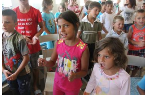
Happy children on summer camp

Children and young people from all of FCE's projects get the opportunity to go on a summer camp at FCE's camp venue in the village of Chislaz. Thank you to all of you who have made this financially possible! A second hand store in Vänersborg, Sweden, run by the Pentecostal church and Eriks, donated money to enable 50 children to have an unforgettable camp week! The children who come from poor circumstances especially appreciate these camps very much! At home it is necessary for them to help work making sure there is food on the table for the family very often they go to bed both dirty and hungry. For these children the camp with baths, fun activities, care, food and security is like heaven. Thank you also to all you Romanian volunteers who help on these camps!