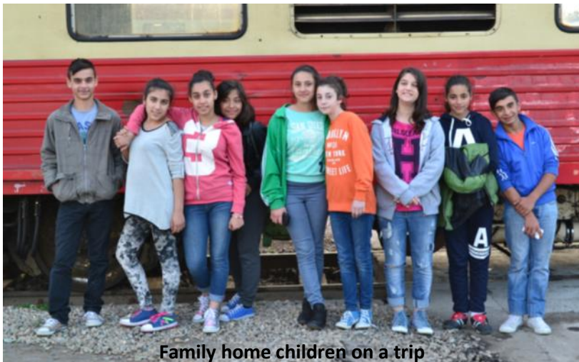
Family home children on a trip

We are glad to be sending a Spring greeting to all of you who are interested in FCE's work in Marghita! All your support means a lot!